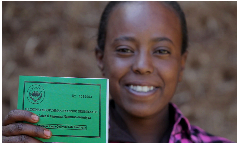
➔ Ethiopian woman holds the land certificate in which she is named.