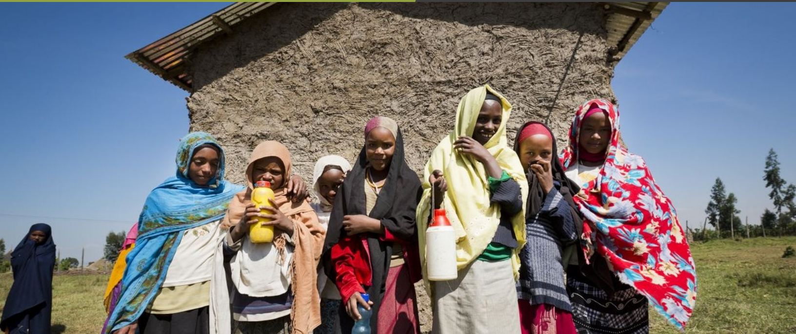
➔ Young Women in Ethiopia.