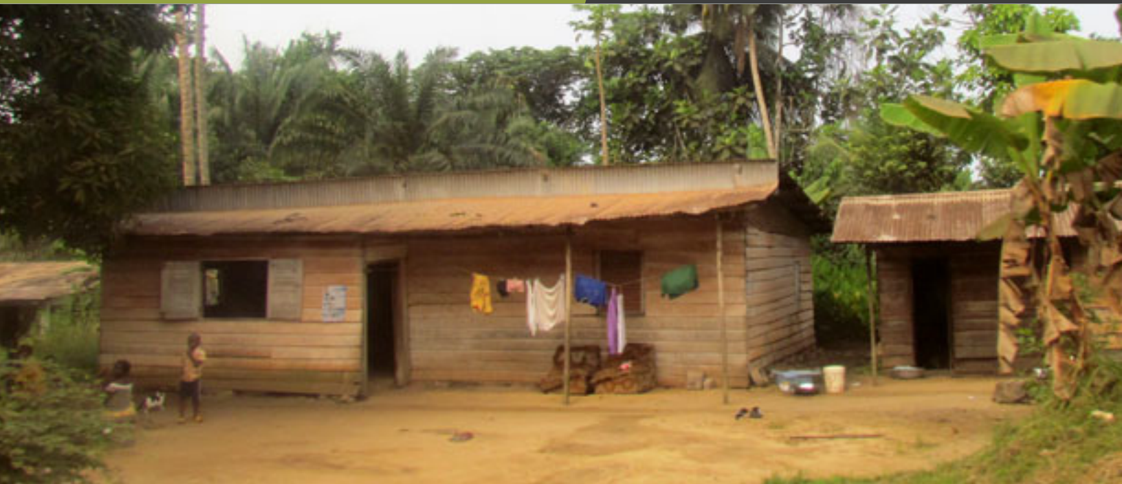
➔ Under the 1974 legislation, a land title was the only protection against eviction. Land reform in 2005 sought to simplify the land titling process.